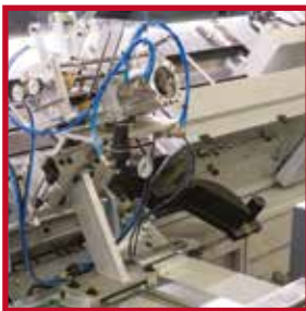
Hangers former and feeder